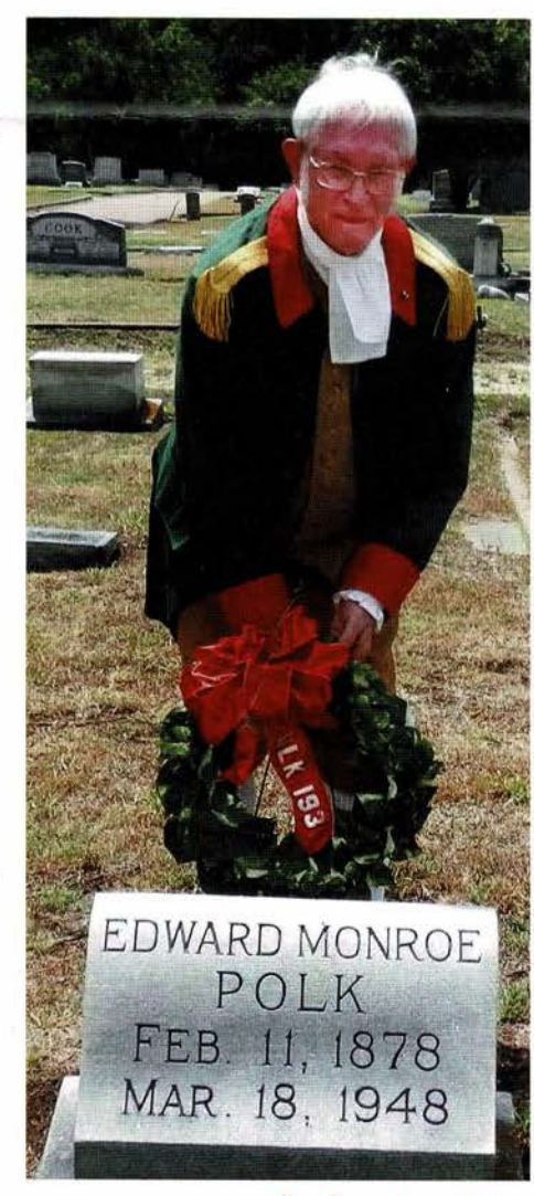
The Jexas Compatriot

In November, chapter members were scheduled to go to Bonham to serve lunch and give gifts to veterans.