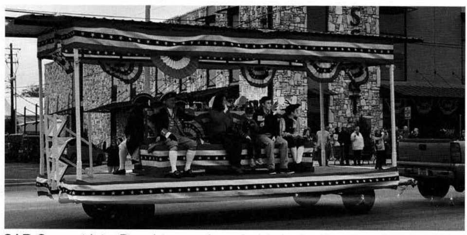
SAR Compatriots, Daughters and youth ride in the Fredericksburg parade.