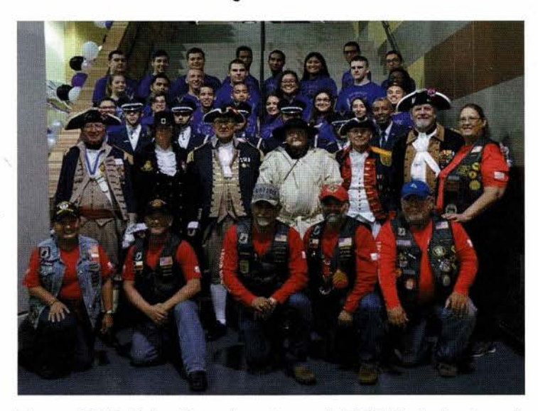
Texas SAR Color Guard, vets and JROTC students celebrated the 100th anniversary of WWI armistice on Veteran's Day.