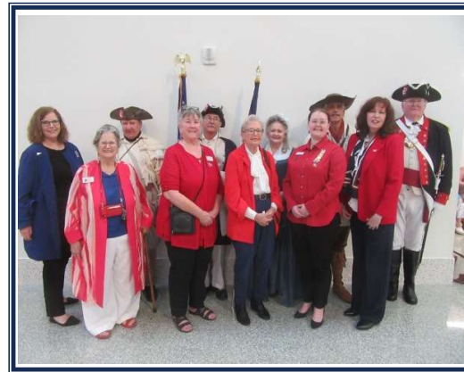
February ceremony with Color Guard and DAR Members