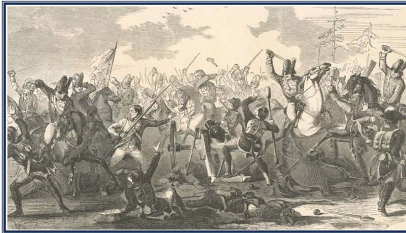
Depiction of the Battle of Ramsour's Mill

Today, there are only four burial markers at the battlefield site. The most notable marker belongs to a mass grave where unidentified dead were buried. Additionally, there are a few individual grave markers on the site, but the location of the pile of stones that marked Peter Costner's final resting place is unknown.