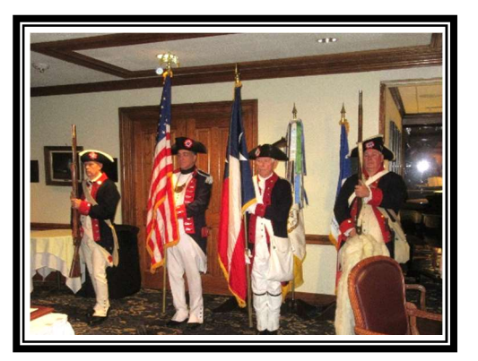
SA Chapter #4 Color Guard

Gala Pictures A wonderful night of celebration