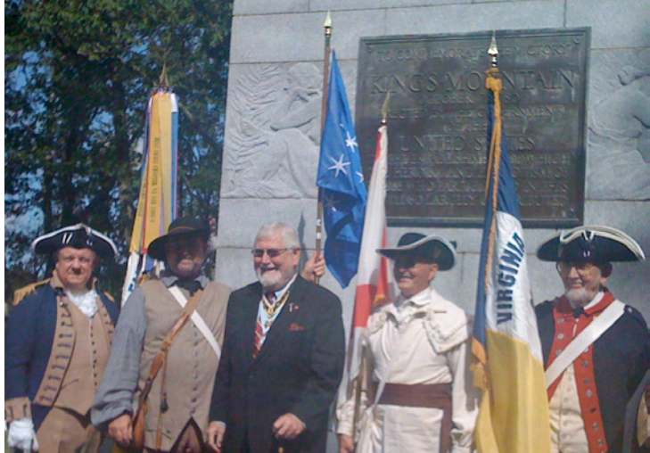
PG Butler with various Compatriots at Kings Mountain commemoration