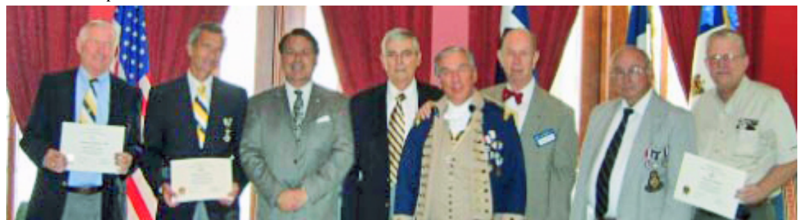
CERTIFICATES PRESENTED TO THOSE WHO HELPED WITH JR ROTC AWARDS