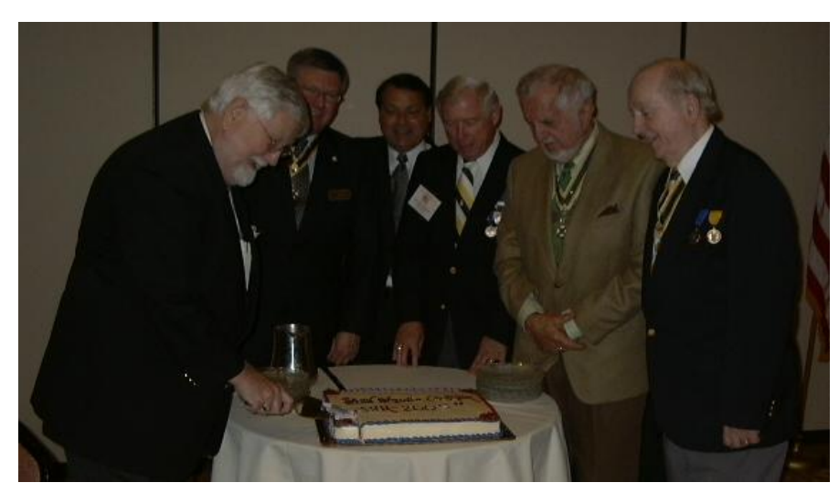
Current and former Chapter Presidents cutting Chapter birthday cake in April 2005

The ceremony will take place at the main flagpole on Stanley road---there is parking across the street. We have been included in their program----to ring the bell 13 times representing the 13 original states.