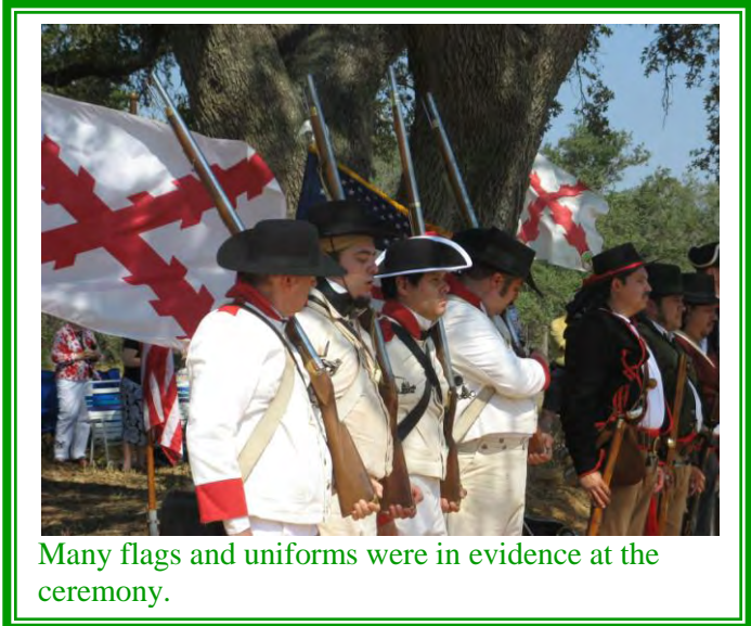
Many flags and uniforms were in evidence at the ceremony.