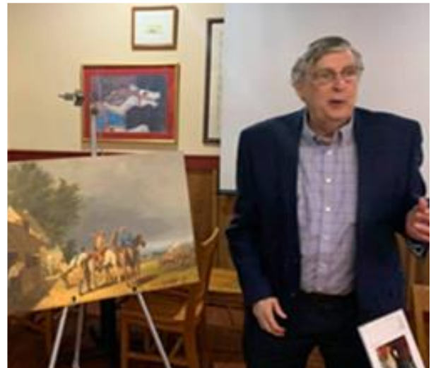
His presentation settles on tying together five different artists from 1783 through 1857 beginning with Benjamin West followed by Charles Willson Peale, Rembrandt Peale, John Trumbull and William Ranney.