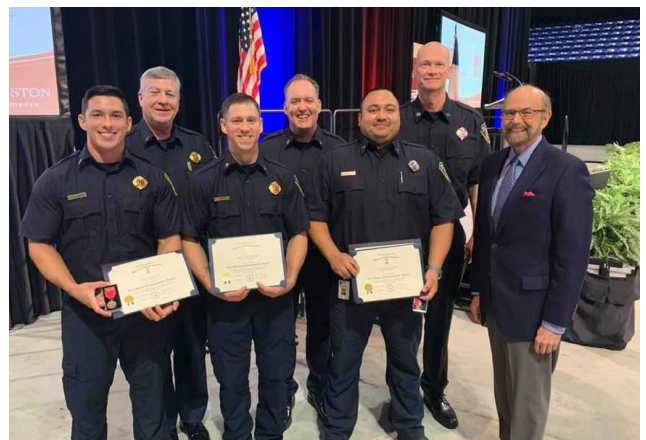
The Fire Safety Commendation and Medal is presented to an individual for accomplishments and/or outstanding contributions in an area of fire safety and service. Cy-Fair Volunteer Fire Dept. Ladder 13 and Engine 8.