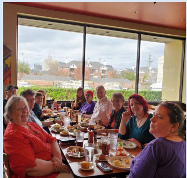
Afterward, debriefing over a meal.