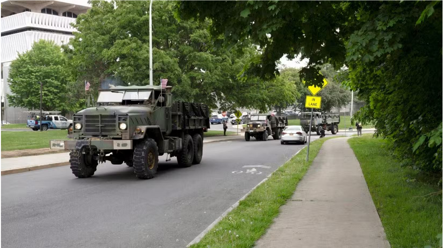
Members of the NY-Penn Military Vehicle Collectors Club, escorted by the New York State Police, transported the remains to the Lake George Battlefield State Park.