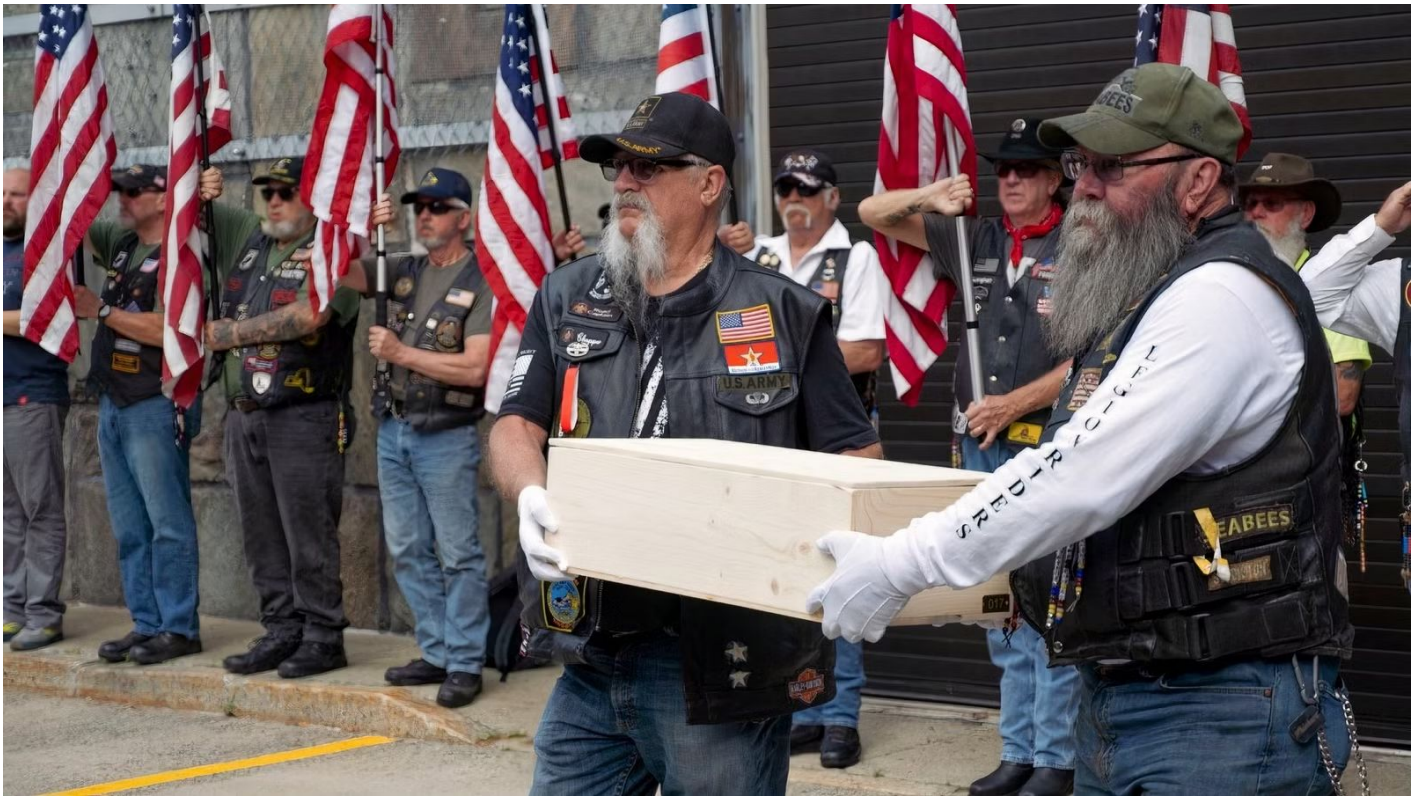
The Patriot Guard Riders provided a motorcycle escort for the 44 Revolutionary War soldiers interred at Lake George Battlefield State Park.