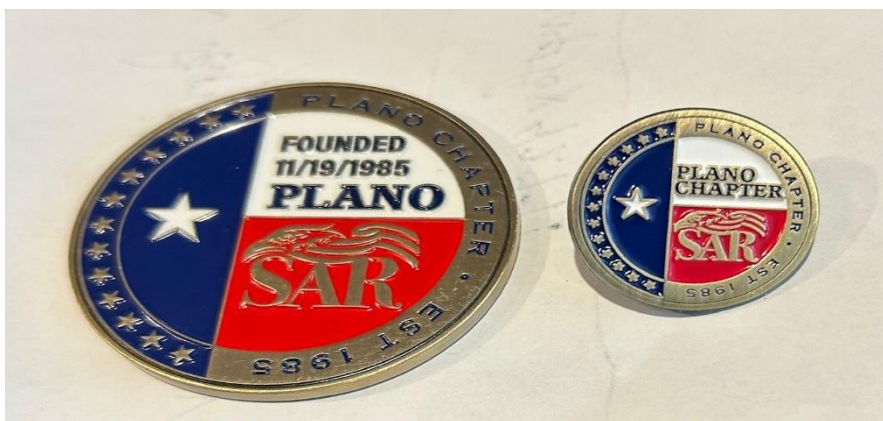
Chapter Commemorative Coin, Left—Community Service Lapel Pin, Right

Let's get involved—more of us—especially at the time of our country's 250th Anniversary!