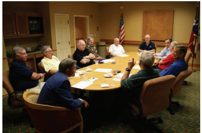
PineyWoods Chapter business meeting held August 8, 2009 at Homewood Suites.