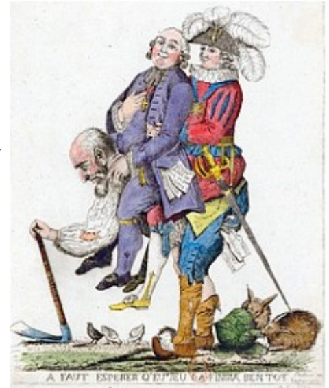
The THIRD ESTATE CARRIES the CLERGY and ARISTOCRACY 1789

France continued to struggle politically, the people unhappy, when on November 9, 1799, the young, popular, Napoleon Bonaparte staged a coup d'état, abolishing the Directory and declaring himself First Consul. The new ERA began. The struggle of the French from 1789 to 1800 is too detailed to review here. LGS