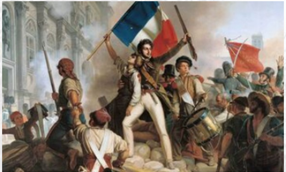
The Famous Painting of the Fight on the Barricade is re-enacted in scenes of the musical, Les Misérables

I wonder if historians have ever studied the effects on the thousands of common French soldiers who landed in Newport, Rhode Island, 1779. The British had abandoned Newport in 1779 but still held a Naval presence in the area. The French were nothing but an occupation force until July 1781 when Rochambeau marched to join Washington's Army at White Plains, New York. As part of Washington's Army, they marched south into Virginia and forced Cornwallis to fortify Yorktown. After the combined American and French victory, nearly all the French Army boarded vessels and sailed back to France. The revolutionary fervor of the Americans traveled with them back to France.