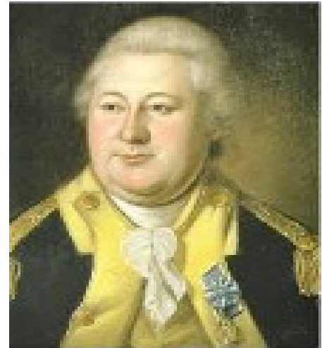
Henry Knox Charles Willson Peale, 1783, Portrait Gallery

1777 Oct. 4 - Americans driven off at the Battle of Germantown. On October 2nd, Washington conceived a bold plan of attack on Howe's 9,000 troop garrison stationed in Germantown. It called for the simultaneous advance of four different units of troops — moving by night. At dawn, the four columns were to converge not far from General Howe's headquarters and catch the British by surprise. The morning started well for the Americans who had the British retreating. But Washington's plan went astray when one of his four columns lost its bearings in a dense fog and thick smoke. Others columns failed to coordinate effectively. The British defense was particularly strong at a Germantown mansion named Cliveden where dozens of soldiers had taken refuge. Valuable time was lost while the Americans under Henry Knox bombarded the house. Those inside did not surrender because they feared that Anthony Wayne's men, still furious over the Paoli Massacre, would kill them anyway. In the end, bad luck and poor timing forced Washington to retreat to Whitemarsh with the British in pursuit.