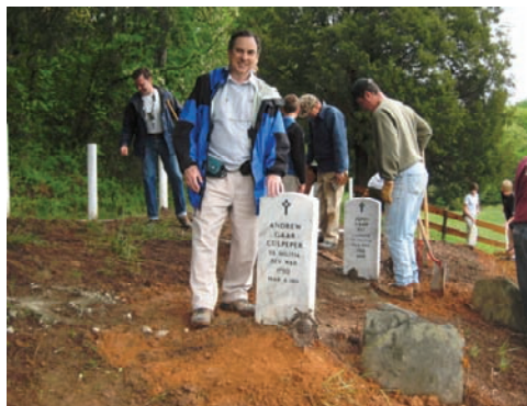
BELOW: Photos from May 15, 2008 Meeting.