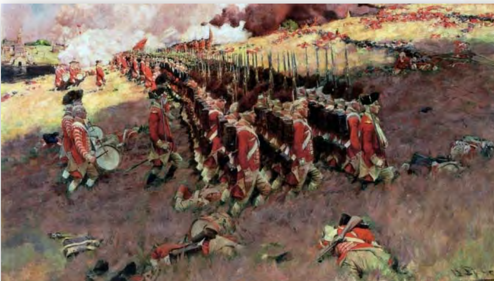
Breeds Hill 1775