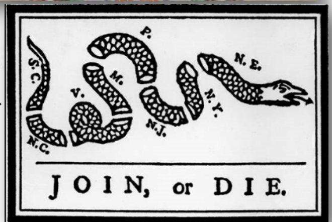
Benjamin Franklin Slogan 1754