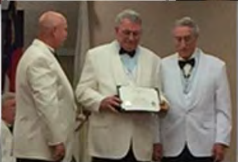
July 11th, South Central District Breakfast. The south Central District is a five state area with Arkansas, Kansas, Missouri, Oklahoma, and Texas. Common interests are discussed as well as Compatriots running of National Offices drop by.