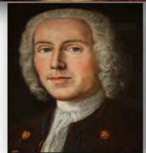
Gov. Thomas Hutchinson