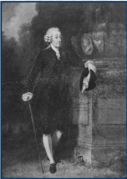
Peter Oliver 1713-1791

The meeting house had been abandoned by Reverend John Lathrop and his patriot congregation, most of whom had left Boston. In the same month, Oliver published an address urging Continental soldiers to stop, think, and abandon the Patriot cause. Two months later, he left Boston with the British as the evacuated Boston and eventually returned to England. In 1781, he published an irate account of the pre-revolutionary period titled, “Origin and Progress of the American Rebellion”.