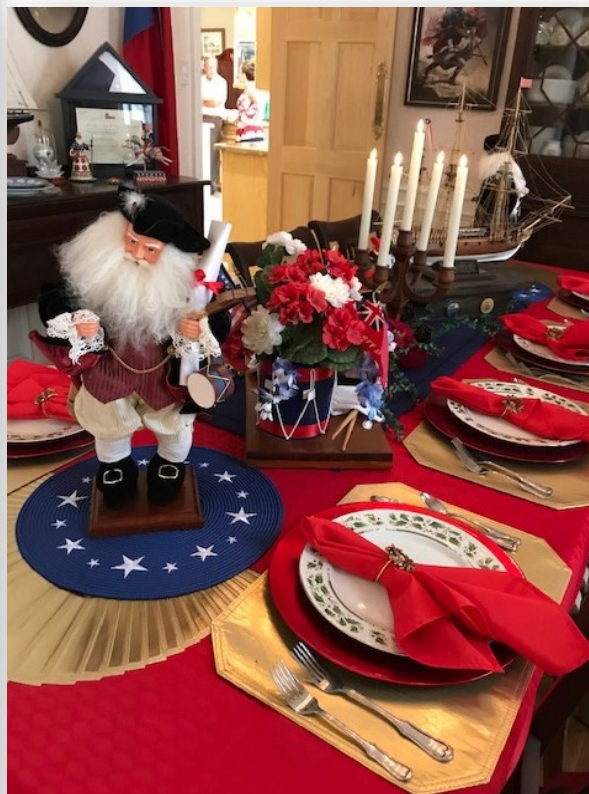
Patriotic Dining Room