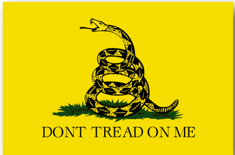
The Christopher Gadsden Flag adopted 1775

“I recollected that her eye excelled in brightness, that of any other animal, and that she has no eye-lids. She may therefore be esteemed an emblem of vigilance. She never begins an attack, nor, when engaged, ever surrenders: She is therefore an emblem of magnanimity and true courage. As if anxious to prevent all pretensions of quarreling with her, the weapons with which nature has furnished her, she conceals in the roof of her mouth, so that, to those who are unacquainted with her, she appears to be a most defenseless animal: and even when those weapons are shown and extended for her defense, they appear weak and contemptible; but their wounds however small are decisive and fatal. Conscious of this, she never wounds ‘till she has generously given notice, even to her enemy, and cautioned him against the danger of treading on her. ”