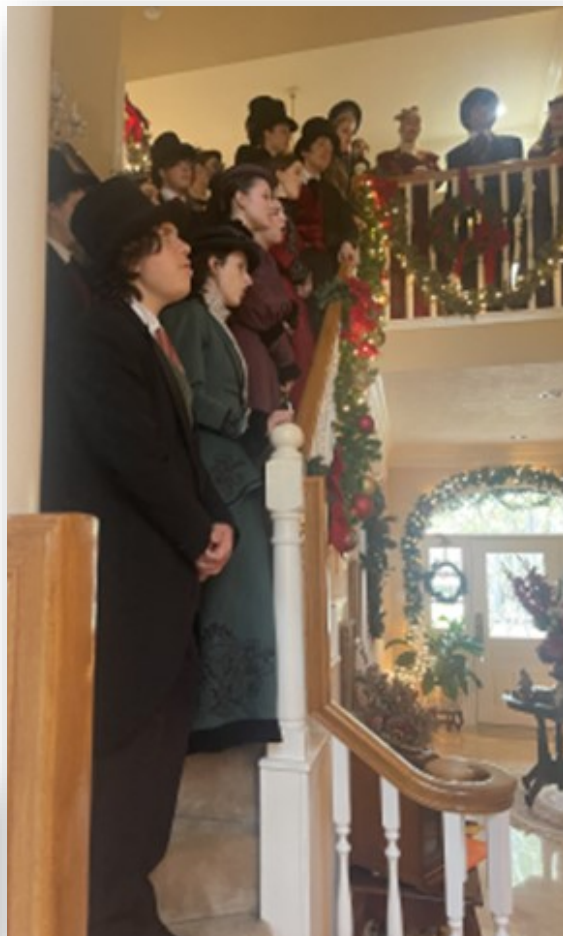
Kingwood High School Madrigal Choir