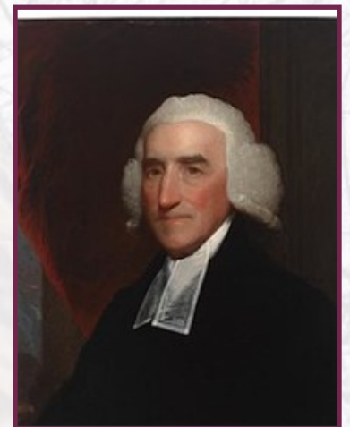
John Lathrop 1740– 1816 Minister Boston Second Church Boston

January 20, 1776 – The Virginia Convention declares that the best method of opposing British oppression would be to open all ports to international trade from every country except England.