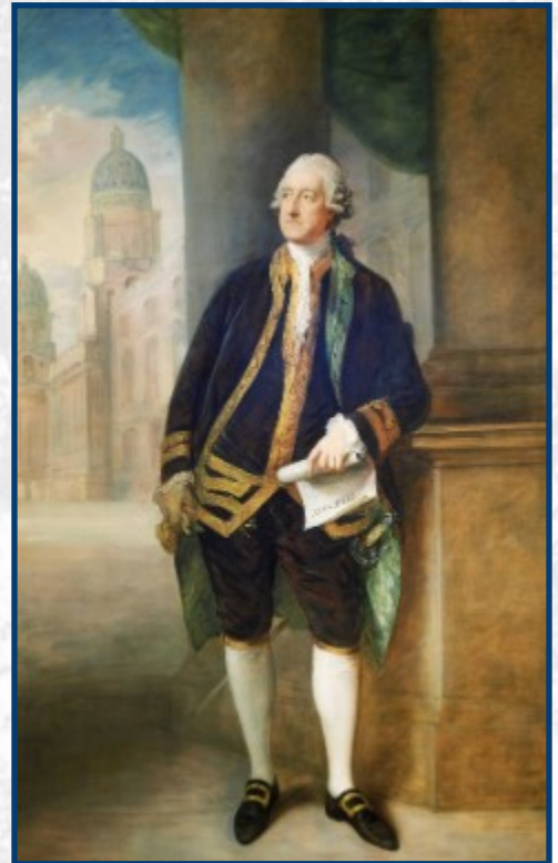
John Montagu, 4th Earl of Sandwich (The Sandwich Man) 1718-1792

January 22, 1776 – The South Carolina Council of Safety resolves ‘that able bodied negro men be taken into public service, and enrolled and employed, without arms for the defense of the several batteries in Charles Town, Fort Johnson and other batteries, at the rate of two to each gun.....That they be in constant pay at the rate of ten shillings per day, and the public to find them provisions....suitable rewards shall be given to those slaves, who behave well in time of action.