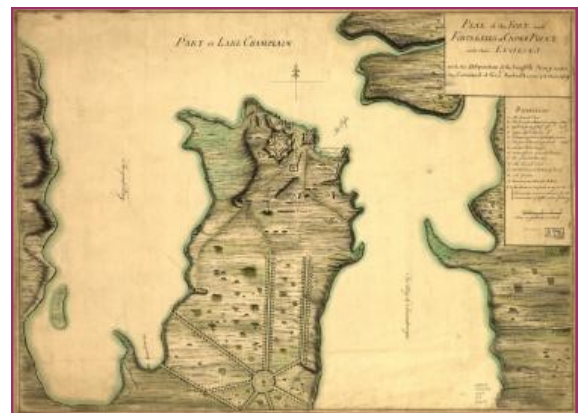
Fort Saint-Frederic 1734 Crown Point Lake Champlain New York

Although meant for the French and Indian War, the flag became a symbol of protest for the American Colonist expressing their opposition to the Stamp Act of 1765, and the other taxes imposed on the colonies to pay for Crown Expenses incurred during the French and Indian War campaigns.