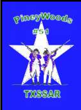
PineyWoods Chapter #51 Texas Society of Sons of the American Revolution