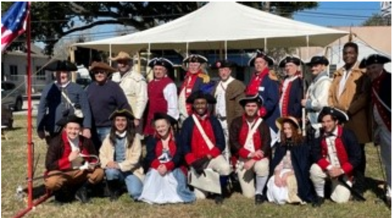
Below—Most of the Cast of Characters—10 Students and 9 Texas SAR Men in Uniform