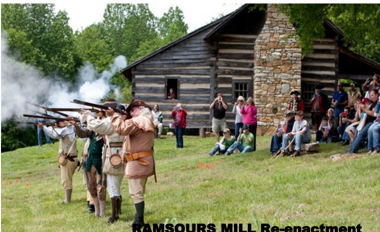
RAMSOURS MILL Re-enactment