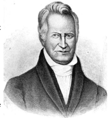
Gen. Griffith Rutherford 1721-1805

During this time, Loyalist Lt. Col. John Moore, of Hamilton's Tory Regiment, had returned to his home near Ramsour's Mill from Charleston. He had served at the Siege of Charleston. He called together a group of forty Loyalist on June 10 and shared with them instructions from Cornwallis that they should avoid organizing before the British were in the area. At that time Moore learned there were about twenty Patriots looking for them. Moore tried unsuccessfully to confront them and sent fellow Loyalist home. He instructed them to meet him at Ramsour's Mill on June 13. On June 13 two hundred men met him at the Mill. The number grew and by June 20 the camp had grown to about 1,300 men. American General Griffith Rutherford encamped just to the east near Charlotte, North Carolina, learned in of the loyalists assembling at Ramsour's Mill. Rutherford began cautiously moving his forces in that direction. He was aware the British General Lord Ramdon had camped his British forces at Hanging Rock, South Carolina, some 40 miles to the west of the mill.