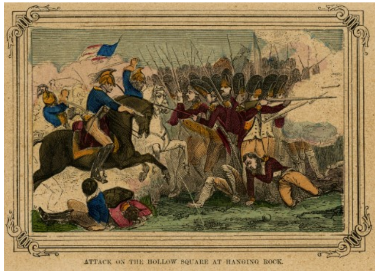
Hanging Rock 1780