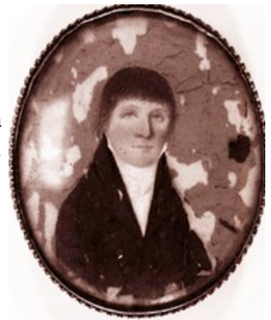
Governor Richard Caswell North Carolina