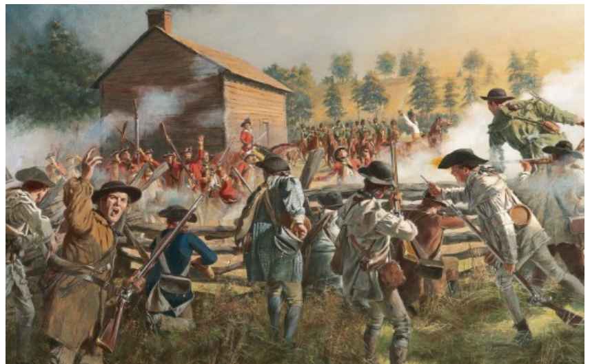
Williams Plantation —Huck's Defeat