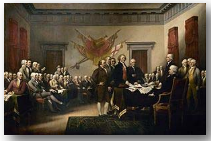
Declaration of Independence by John Trumbull – Committee of Five June 28, 1776

George Washington General Orders, 2/26/1776,