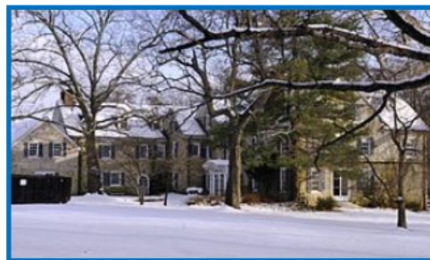
Emlen House—Washington's Head-

around 15 to 20 miles north of Philadelphia. He finally entrenched forces along the Wissahickon Creek and Sandy Run in the hills along Old York Road and Bethlehem Pike. These locations allowed Washington to monitor British movements in Philadelphia. On December 4, 1777, General Sir William Howe marched a force north for one last shot at defeating Washington before winter. But after several skirmishes and never really engaging Washington, Howe called it off returning to Philadelphia.