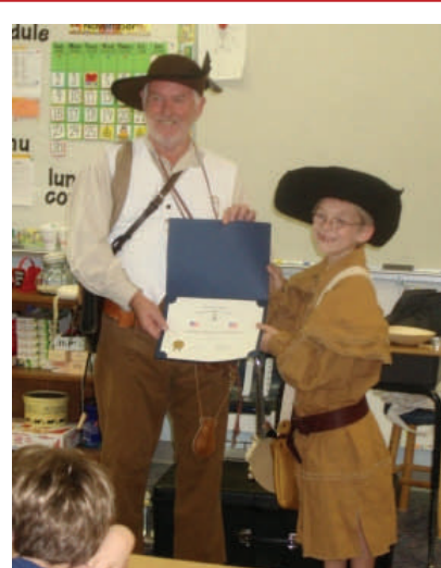
Kingwood Christian School Flag Certificate