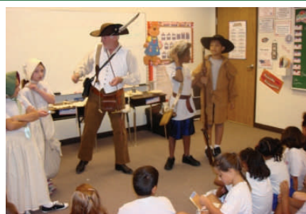
Humble Christian School (Nov. 6) Instructing class with students help.

(Nov. 8) We dressed these kids and the boy has my black powder rifle.