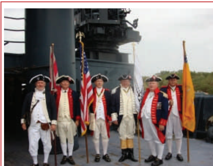
Aboard the Battleship Texas at San Jacinto Battlefield Park.