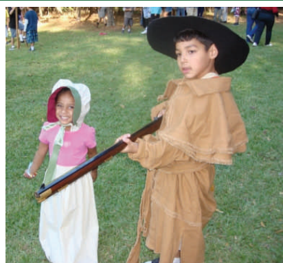
Pioneer Days at Jesse Jones Park

(Nov. 8) We dressed these kids and the boy has my black powder rifle.