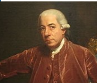
Henry Laurens SC

April 15, 1783 - On this day, Continental Congress ratified preliminary articles negotiated during talks in Paris in April the year before, 1782.