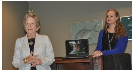
March Program Creekwood Memorial p. 10