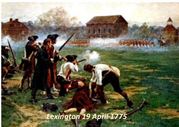
Lexington 19 April 1775

Meeting Saturday, April 21, 2018 Member & Guest