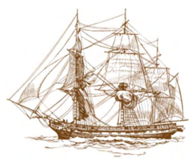
British Frigate similar to the HMS Liverpool ca 1775

December 14<sup>th</sup>, Woodford and Howe, with Howe in command, moved into Norfolk with about 1200 men. Howe immediately adopted a hard line in dealing with Dunmore's ship captains denying them requested supplies for the overcrowded ships. Like Dunmore, Howe understood that he could not hold Norfolk. He recognized that a British expeditionary force could easily land beyond the town and isolate him. He, therefore, sent a message to Williamsburg requesting the town be abandoned.