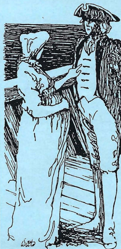
"I have every right to be," Thankful said icily.