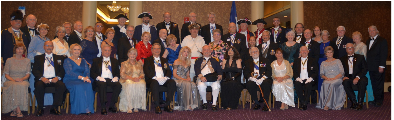
Texas Delegation at National SAR Conference, Louisville, KY, June 2015