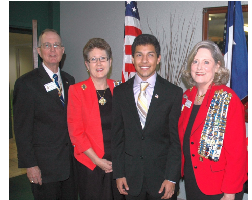
Oration 2013 TX won National