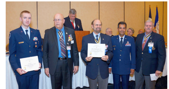
JROTC 2012 TX won National