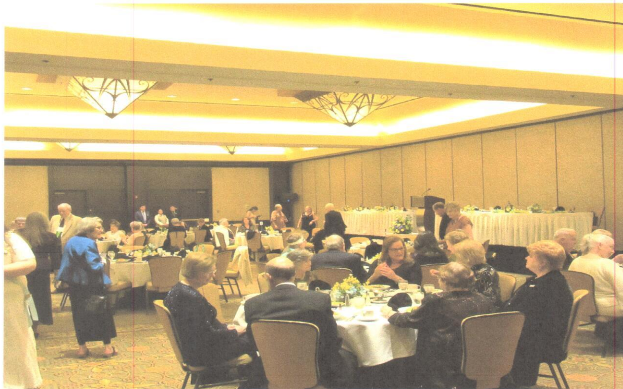
Some of those in attendance at the Colonial Dames