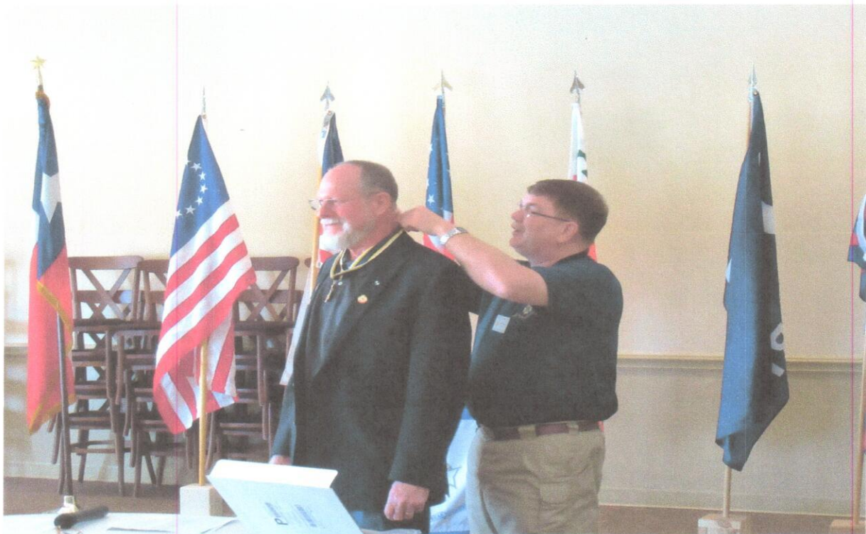
Passing of Chapter Leadership