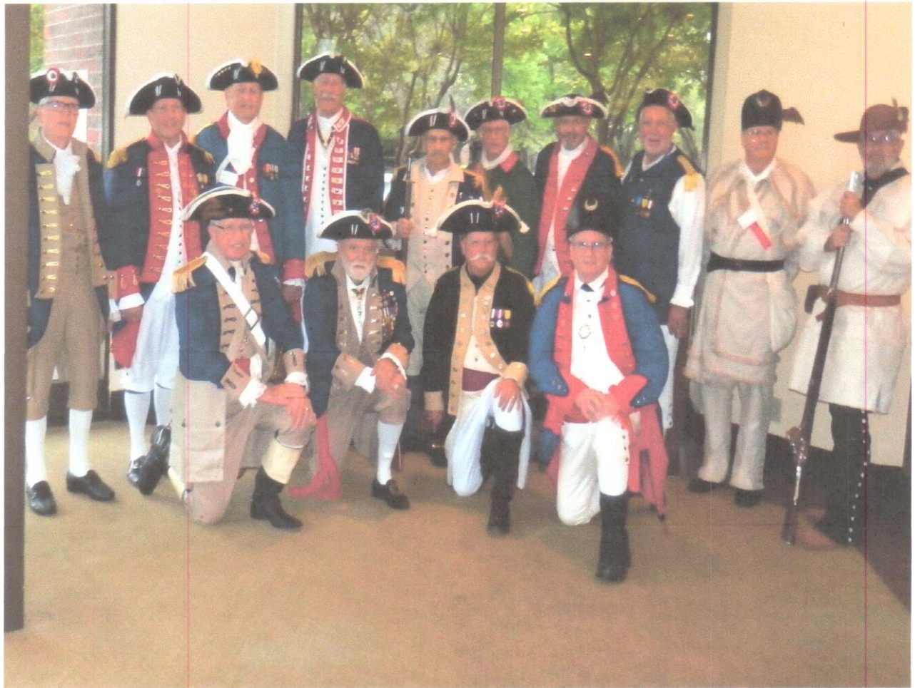
Color Guard on April 7, 2018

On Saturday April 7, 2018, during the 123 rd Annual Convention, the Medal of Honor Parade in Gainesville, Texas was to occur. A Texas Blue Nor-western came blowing in the night before and sent temperature down into the lower 30's. There was a wind to match the temperatures plus it was a cloudy and misty day. All in all it did not dampen the spirits of those who had come to be in the parade nor those who had lined the streets to watch the parade. This year the float with the large Liberty Bell and the Ten Commandments was in from of the Sons of the American Revolution. Also behind us were members of the Preston Shore DAR Chapter. They were lucky to be riding on a trailer and covered. Because of the coldness and the openness of the military vehicles, it was decided that those who were Medal of Honor receipts would not ride in the parade.