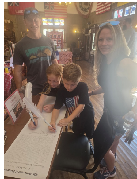
2025 State Fair of Texas DAR House Signing of the Declaration of Independence