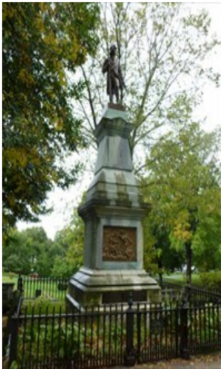
Captors Monument Tarrytown, New York

The next meeting will be Thursday, November 13th at Soulman's Barbeque at 691 East Interstate 30 in Rockwall.