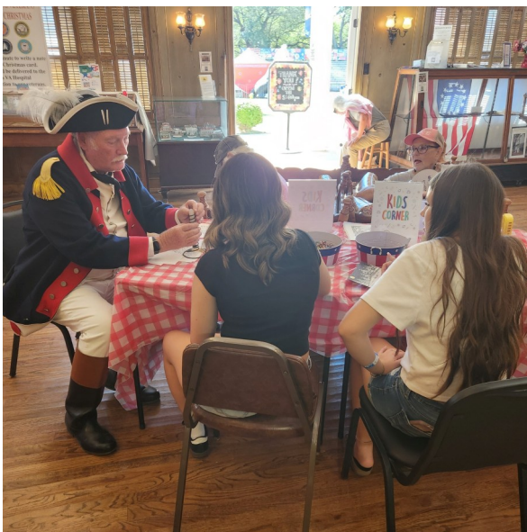
2025 State Fair of Texas DAR House Courting Candle