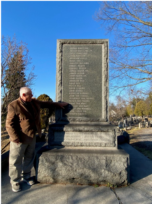
1894 Souvenirs Monument in Tarrytown, New York