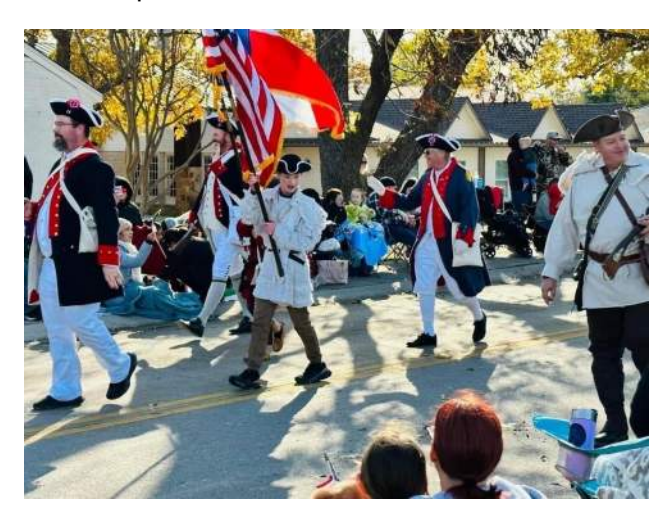
East Fork Trinity Chapter 47 Color Guard