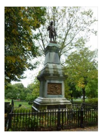
Captors Monument in Tarrytown, NY