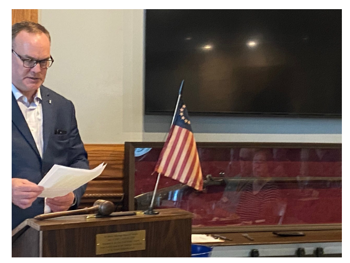
Sons of the American Revolution . East Fork Trinity Chapter #47 . August 2023 Page 2