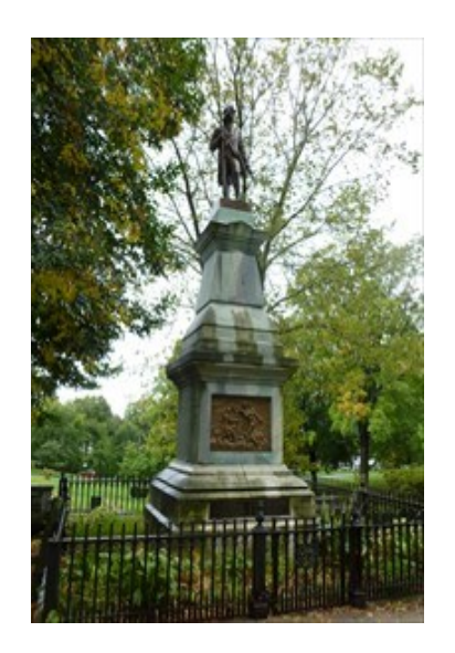
Captors Monument Tarrytown, NY