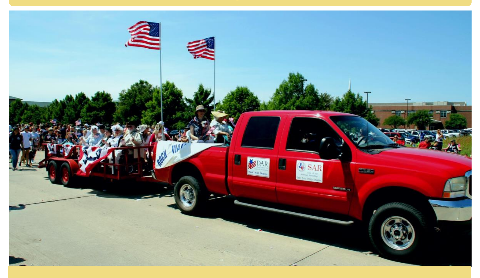
What a fine looking crew!