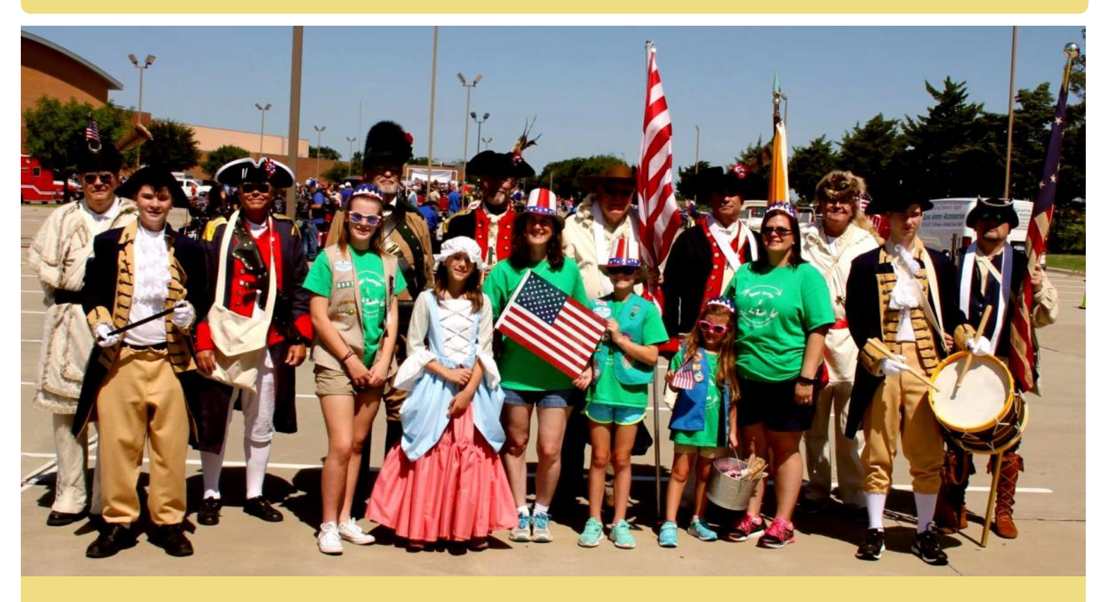
Compatriots of EFT Chapter and Girl Scout Troup 8769 prepare to walk in the Rockwall Independence Day parade (above) and during the parade (below).