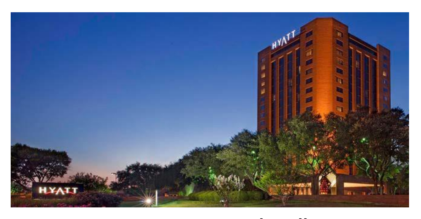
Hyatt Regency North Dallas

701 East Campbell Road Richardson, Texas 75081 Tel: (972) 619-1234 Web: http://northdallas.hyatt.com