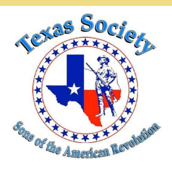
Save the Date 5 April 2018 - 8 April 2018