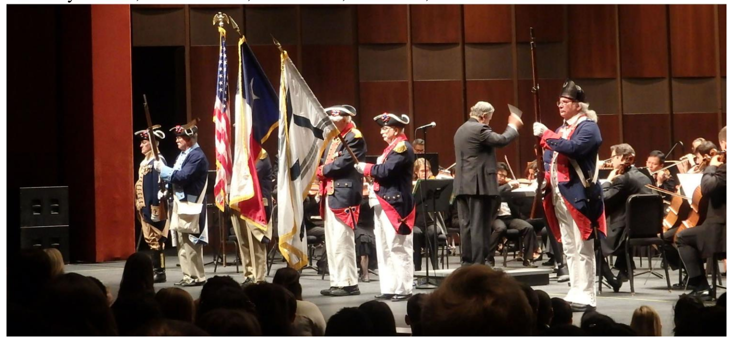
Students stand and salute the American flag while singing the "National Anthem" at the beginning of the concert.