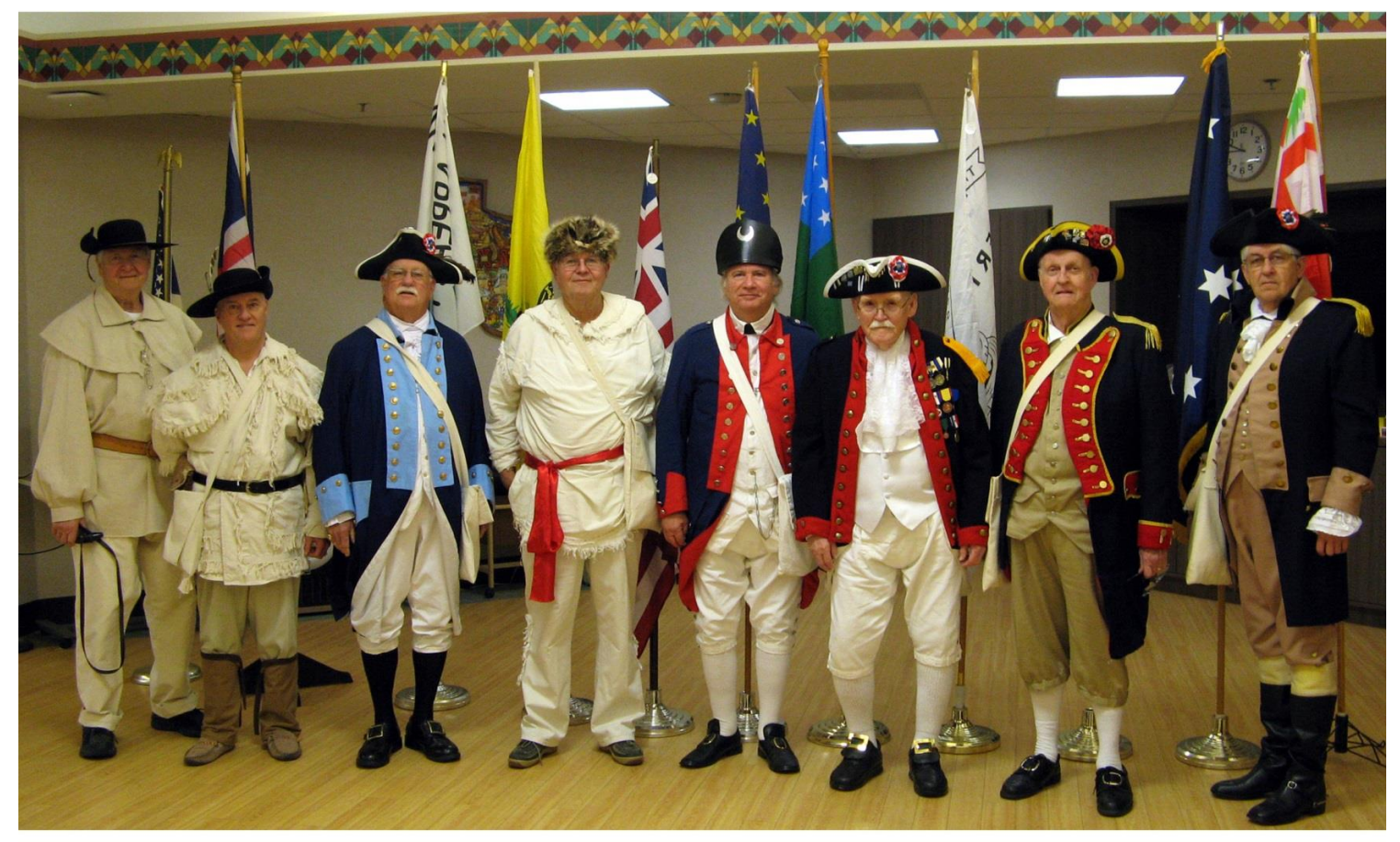
On March 10th members of the Plano, East Fork Trinity and Edmund Terrell Chapters of the SAR made a Flag Presentation to members of the Bonham VA. We had over 35 guests attend the presentation.