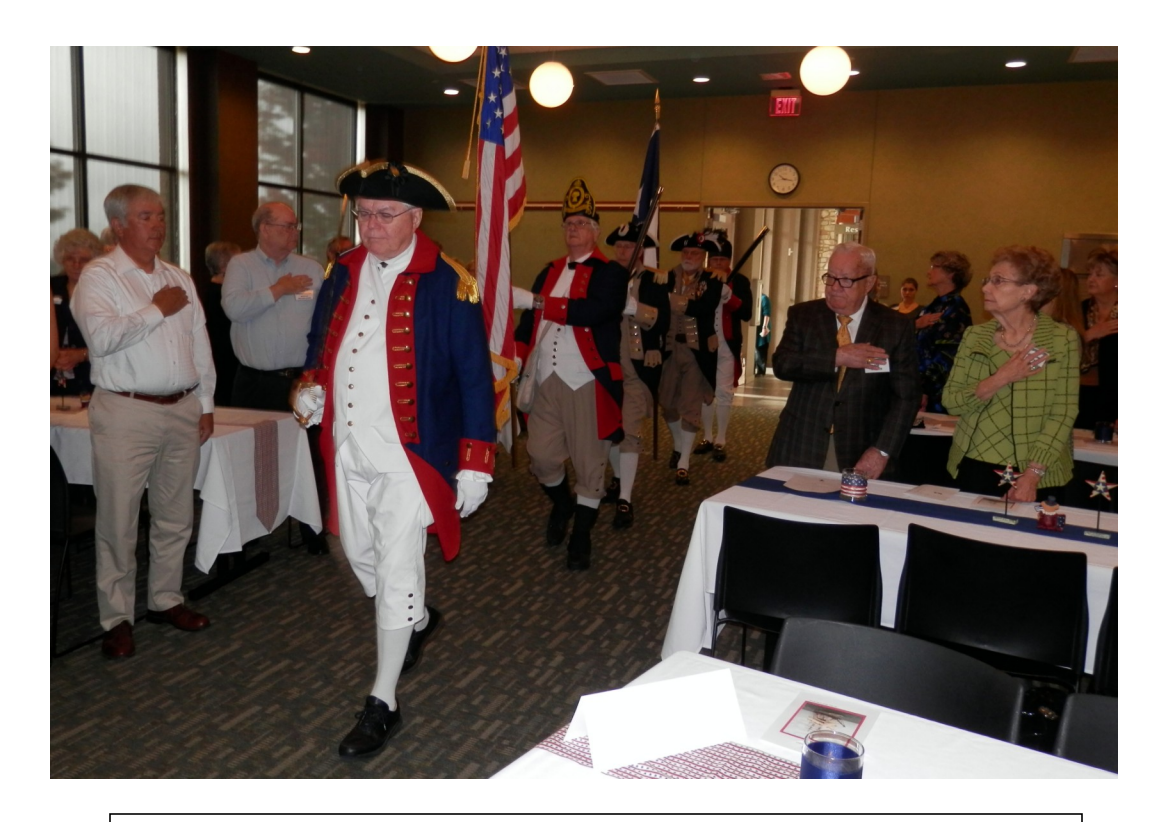
Our chapter's Color Guard posting the colors at the DAR Luncheon.