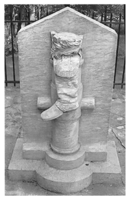
Arnold's Saratoga Monument

Arnold, in declining health and upon reaching the age of 60, died on June 14, 1801.