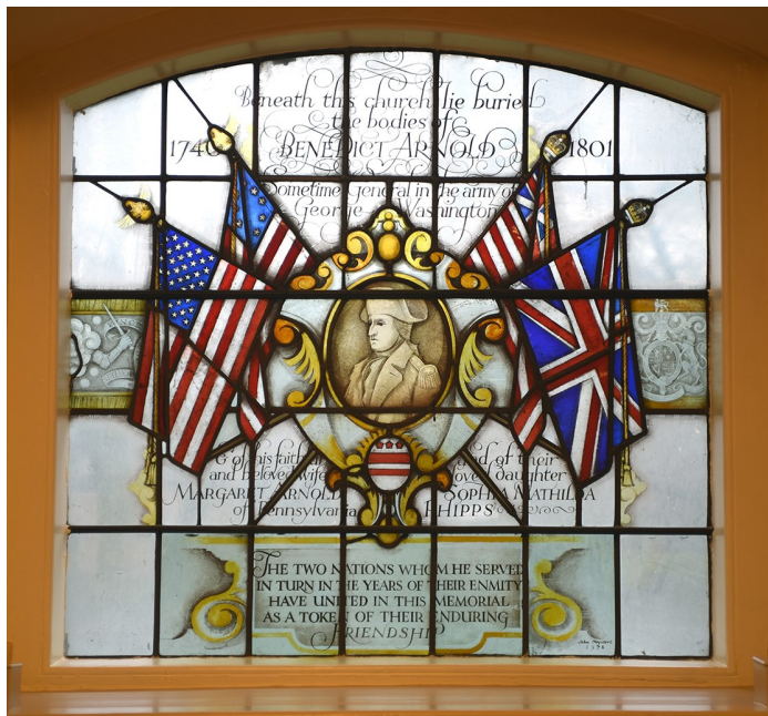
Benedict Arnold memorial window at St. Mary's church, Battersea, London, England