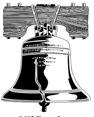
9603 Estate Lane Dallas, TX 75238 ADDRESS CORRECTION REQUESTED