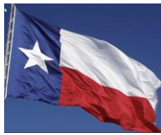
Texas Flag – Gus Hinojosa