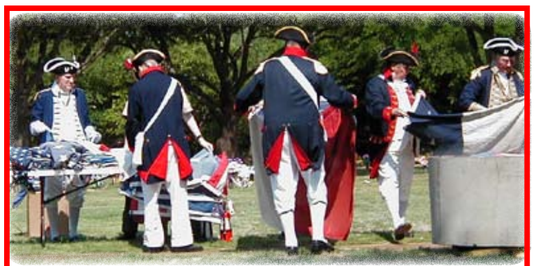
Compatriots in Action Flag Retirement Ceremony Tyler Memorial Park Cemetery, Tyler, TX June 11, 2011