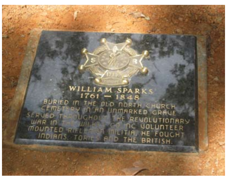
The William Sparks SAR marker placed in The Old North Church Cemetery in Nacogdoches.