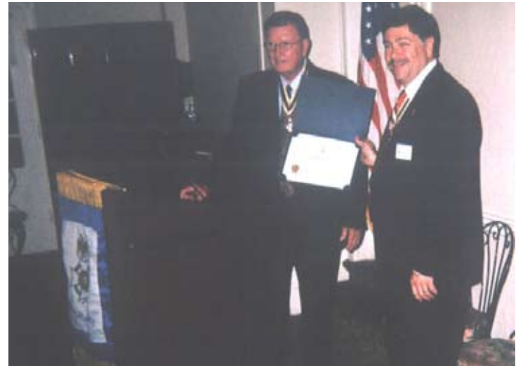
service as Chapter President.