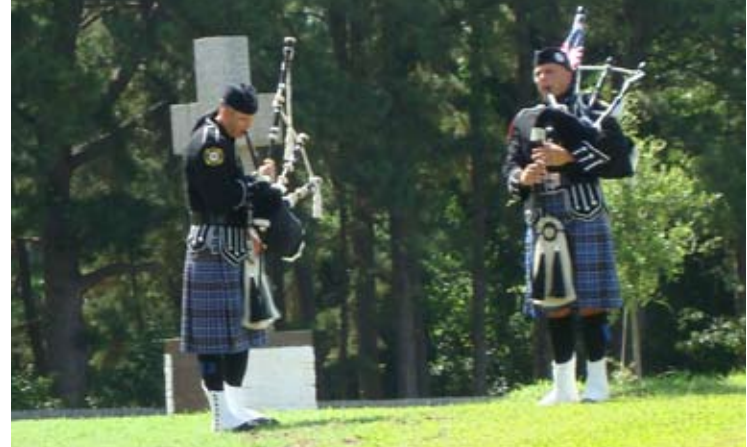
The Tyler Fire Department Bag Pipers performing at The Flag Retirement Ceremony.