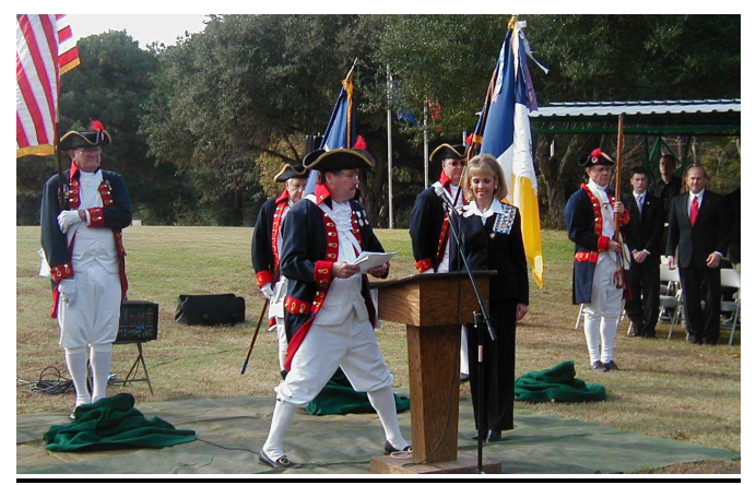
Flag Retirement Ceremony.