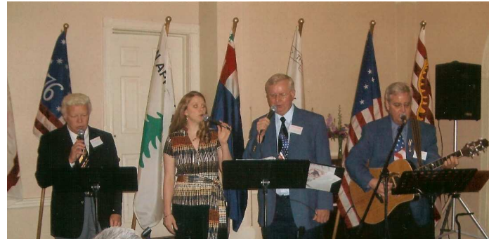
Three Majors and a General entertaining Wm. Barron members and guests at May meeting.