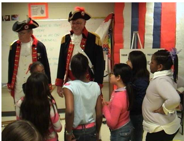
Members of The Captain William Barron Chapter's Color Guard made a presentation to the Jones Elementary School 4 th and 5 th Grade classes.