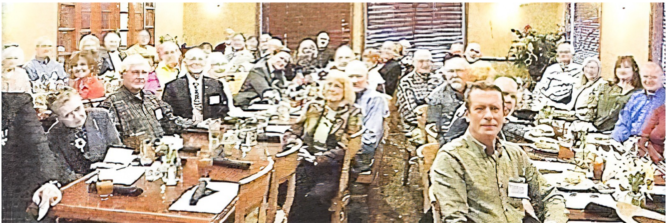
Captain William Barron SAR Chapter Meeting Before the COVID-19 Pandemic

Let's fill the room up again on May 24th.