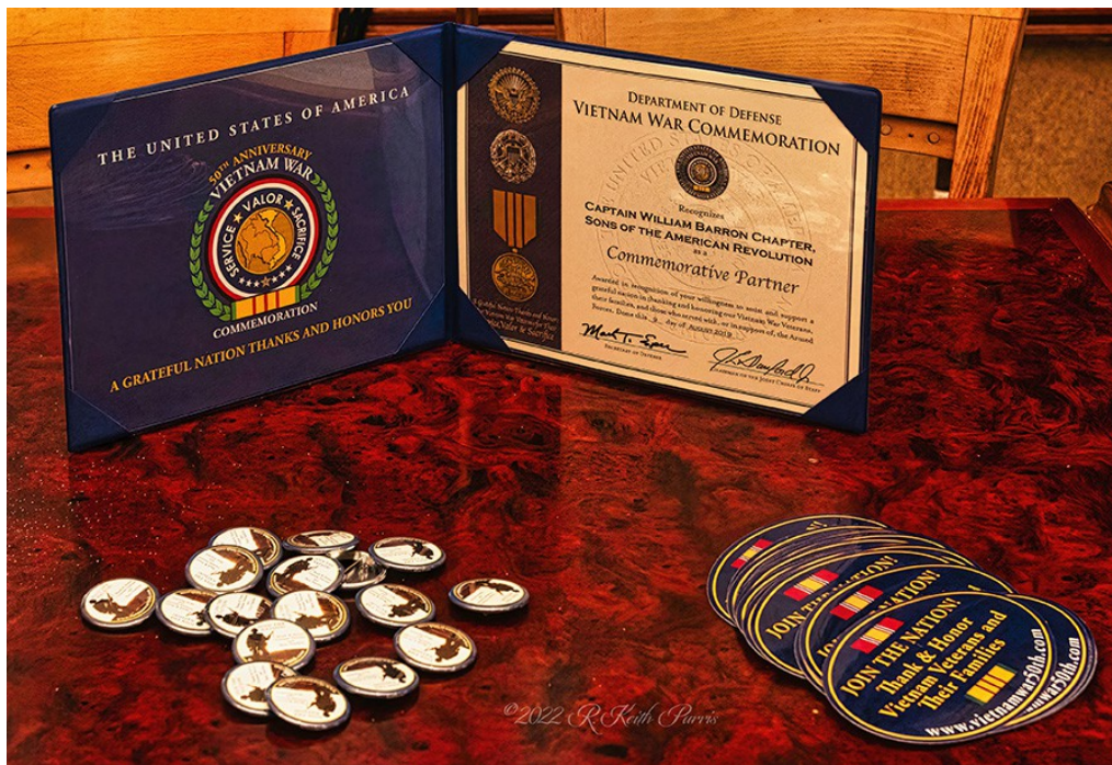
Vietnam War Commemoration certificate, pens, and decals