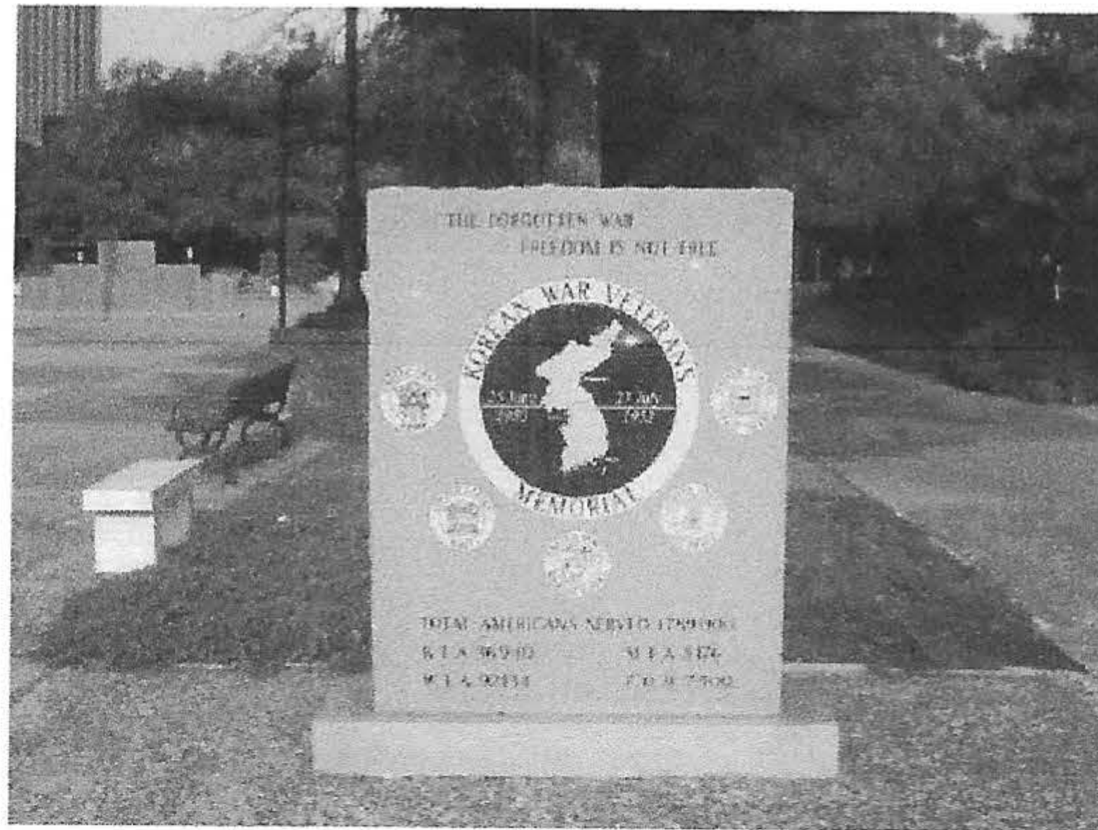
On the Square in Tyler

Our July meeting falls on this National holiday. There is a monument on the square for the Korean War (L) and there is also the Korean War Veterans Memorial (R) in Austin on the grounds of the State Capitol. The Memorial was erected in 1999 by the Texas Lone Star Chapter of the Korean War Veterans. It features a star-shaped Texas Sunset Red Granite pedestal topped with a bronze sculpture of an eagle. Please fly your flag on this day to honor and remember those that served. Take a moment to remember those who gave their all.