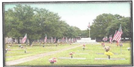
Tyler Memorial Cemetery, Tyler, Texas